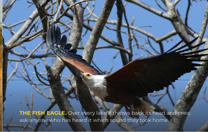
THE FISH EAGLE. Over every lake it throws back its head and cries; ask anyone who has heard it which sound they took home.