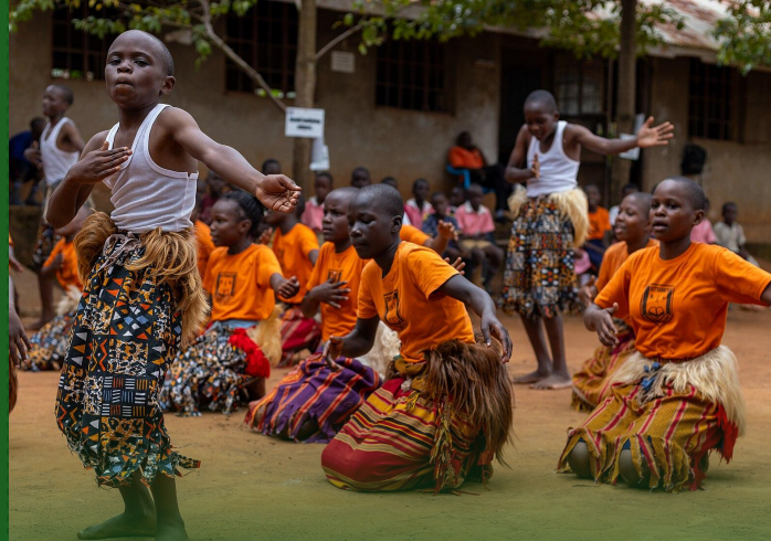
THE DANCE. Drums call, raffia answers; 65 recognized peoples each keep their own, more peoples than Europe has countries.