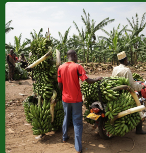
MATOOKE DAY. Nobody on Earth eats more bananas than Ugandans; 95 kinds grow here, one brewed only into beer.

Jackfruit the largest fruit any tree on Earth carries, up to 55 kg