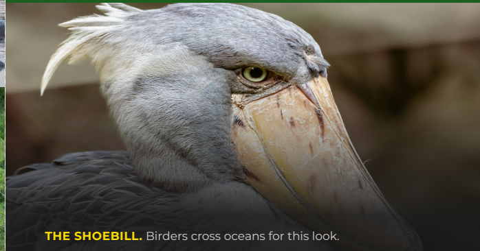
THE SHOEBILL. Birders cross oceans for this look.