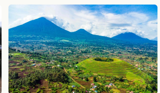
THE GORILLA HIGHLANDS. Kisoro from the air, under the Virungas.