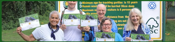
TRAVELLERS WITH THEIR TREKKING CERTIFICATES, BWINDI