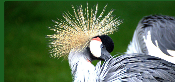
THE CROWNED CRANE. The dancer on the flag.

The crowned crane on the flag really does dance, bowing and leaping in pairs. The shoebill stands 1.5 metres tall in the papyrus at Mabamba and can hold one pose for 4 hours. The Rwenzori turaco wears a red that is actual pigment, turacin, found in no other bird group on Earth.