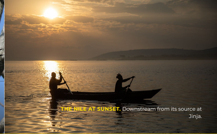
THE NILE AT SUNSET. Downstream from its source at Jinja.