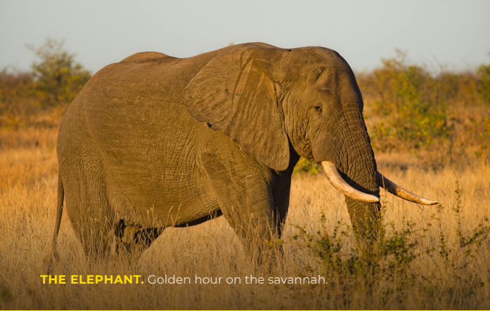
THE ELEPHANT. Golden hour on the savannah.