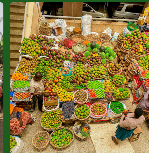
THE FRUIT. Mangoes, oranges and passion fruit by the basket; on the equator the stalls fill all year.

"Wot ki lakwany lum i wangi." ACHOLI · WOT KEE LA-KWA-NYI LOOM EE WAHN-GEE