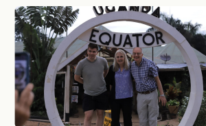
THE EQUATOR. One foot in each half of the world.

You land at Entebbe; the gorillas are a short flight southwest.